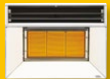
Available in Natural Gas & LPG

Input: 24MJ, 7.0kw Width: 505mm Height: 332mm Depth: 417mm Weight: 10kg