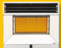
Available in Natural Gas

Input: 25MJ, 7.0 kW Width: 505mm Height: 359mm Depth: 419mm Weight: 10kg