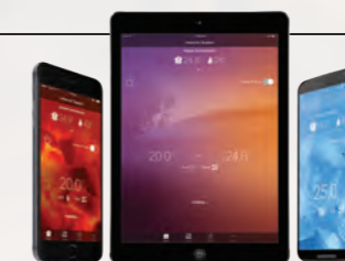
QUE CONNECT Mobile App

To learn more about the ways QUE gives you complete connectivity, see page 16 for information on how you can control your system via the QUE Connect Mobile App on your smart device.