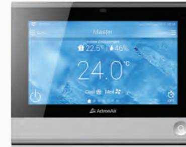
QUE TOUCH Master Controller

The QUE Touch Master Controller allows you to control your entire system, from individual zones through to the dashboard diagnostics, providing access to every feature that QUE comes with. And it looks great while doing it.