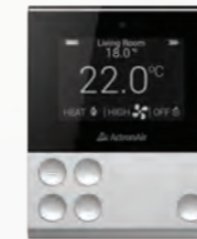
QUE ZONE Zone Controller

The QUE Zone Controller provides you the ultimate in zone control, allowing you to control the temperature and turn the zone (or even the whole system) on or off from inside the zone itself. It also ensures the zone automatically provides the precise air required to meet your specific comfort needs, saving you energy while providing you the ultimate comfort.