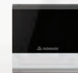
QUE SENSE Remote Sensor

The QUE Sense Remote Sensor delivers the same precise comfort as the QUE Zone Controller, with the only difference being that it has to be controlled from the QUE Touch Master Controller or QUE Connect Mobile App. The QUE Sense is ideal for kids' bedrooms and playrooms, where you'd rather not let the little fingers do the controlling.