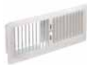
Rear register kit