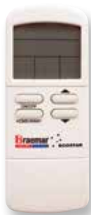
Remote control (WF25 only)