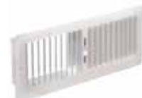
Rear register kit