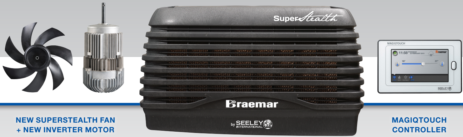
NEW SUPERSTEALTH FAN + NEW INVERTER MOTOR