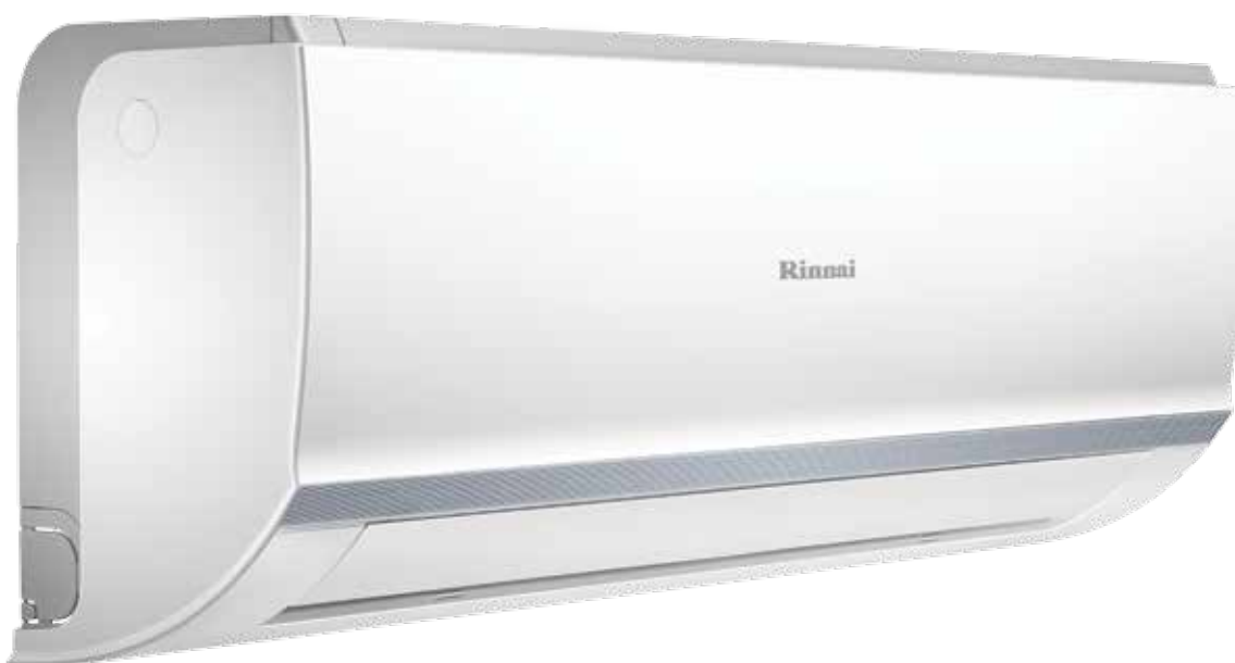
Indoor Header unit