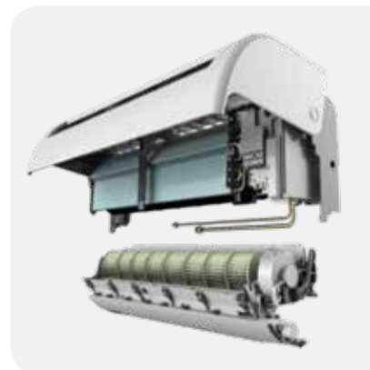
Quick access fan

The D Series design innovation extends to elements of maintenance as well. Featuring a unique, slide out chassis design, the indoor unit allows for convenient access and the opportunity to save time during maintenance.